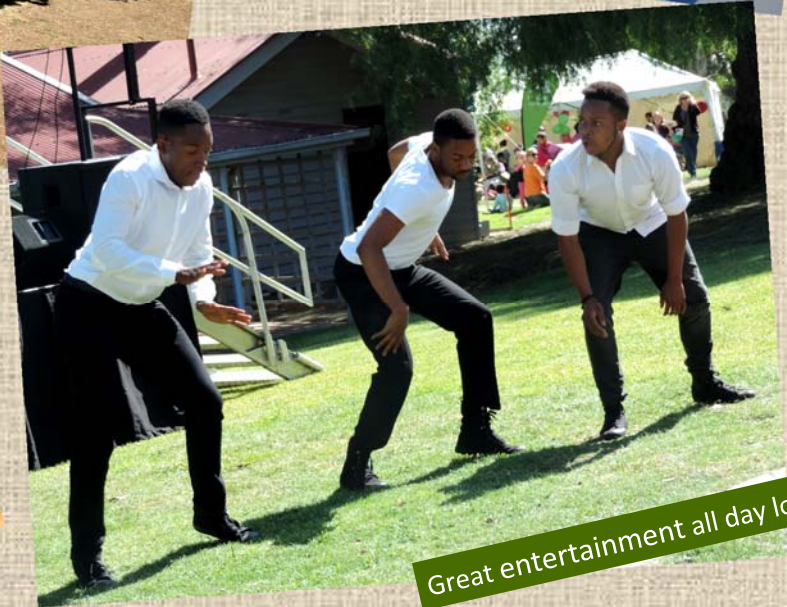
Great entertainment all day long